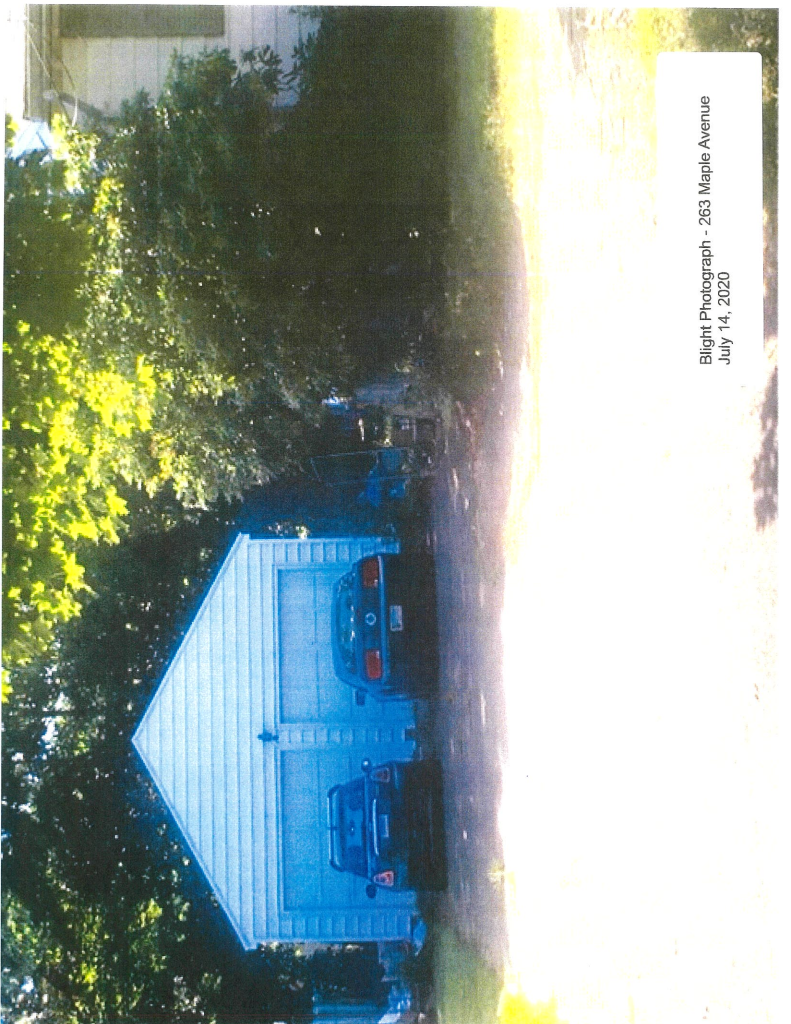
Blight Photograph - 263 Maple Avenue July 14, 2020