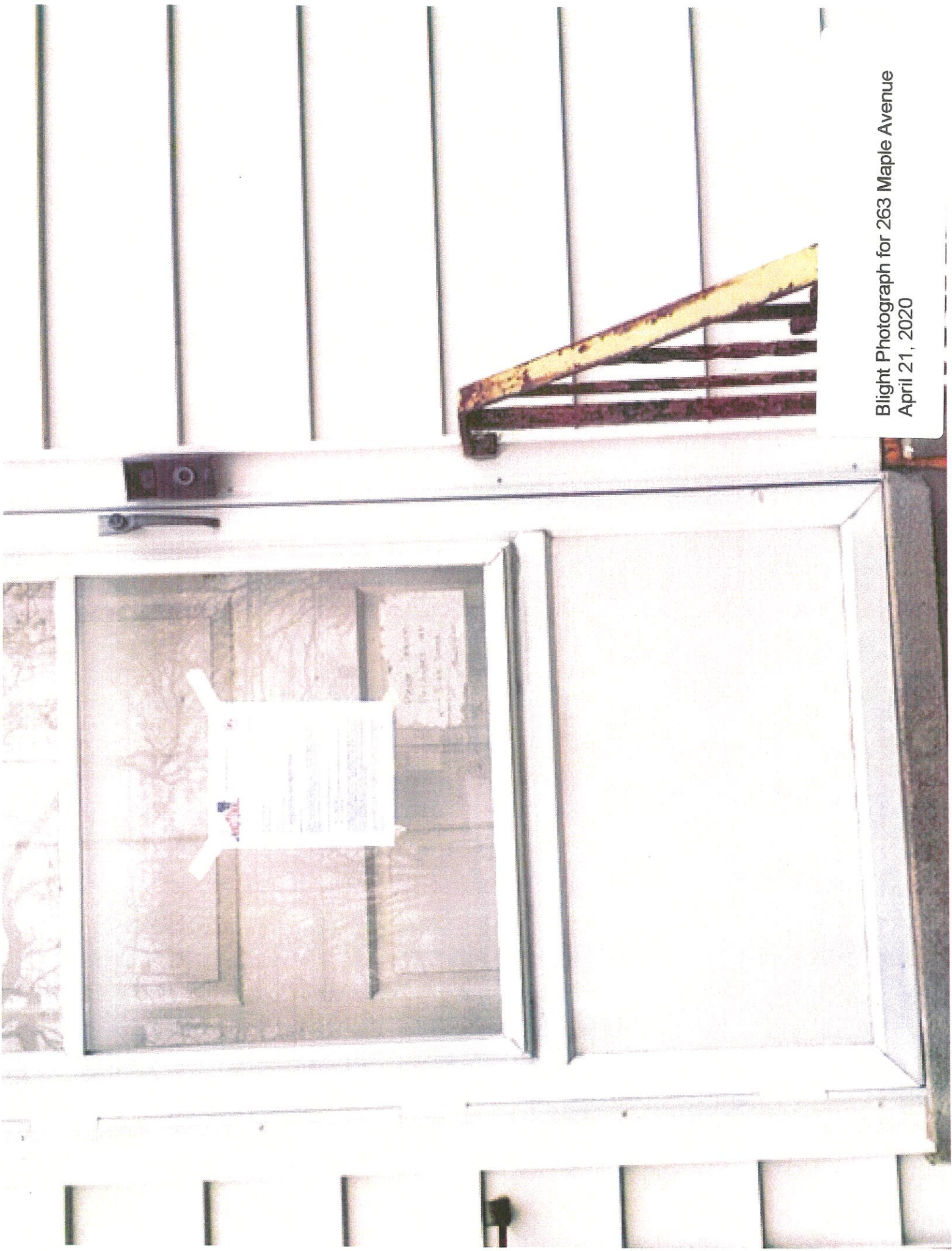
Blight Photograph for 263 Maple Avenue April 21, 2020